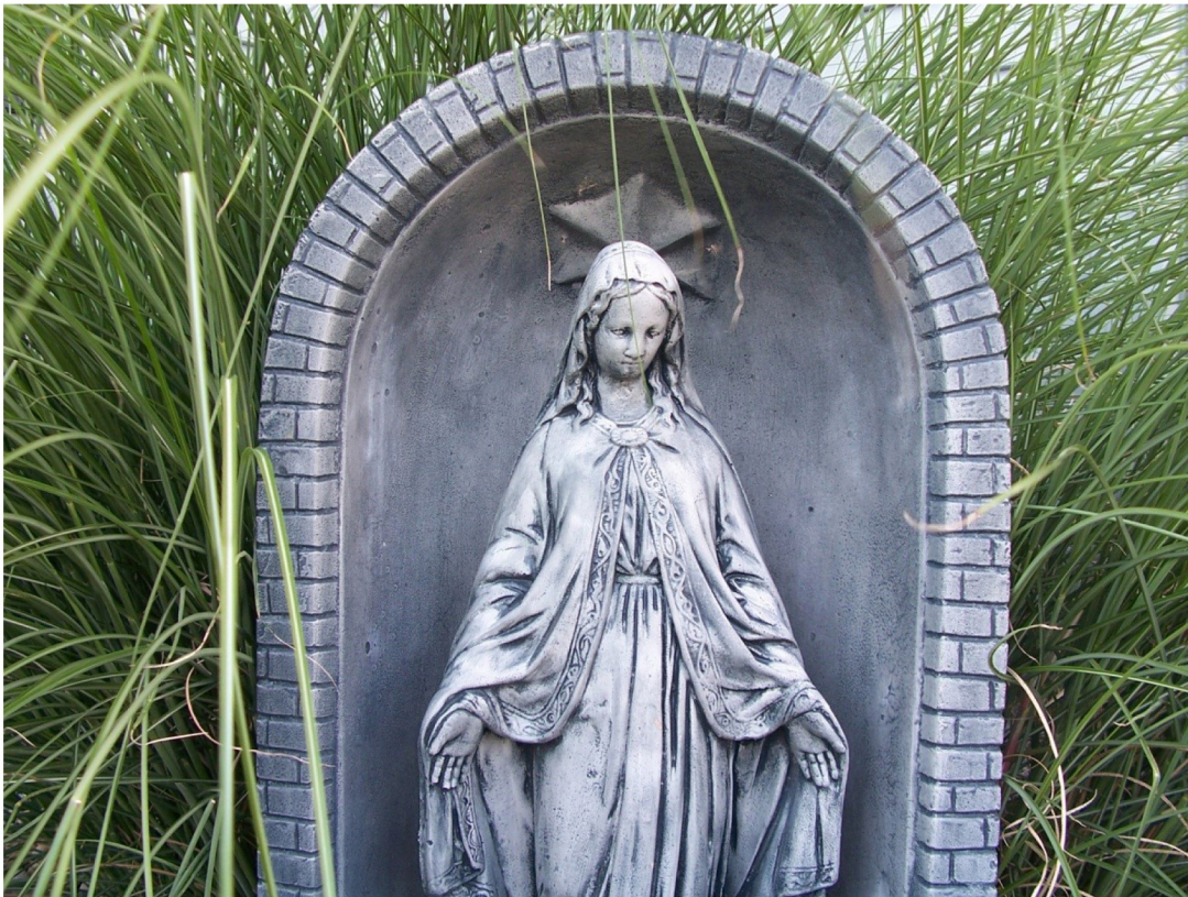
Our Lady Star of the Sea